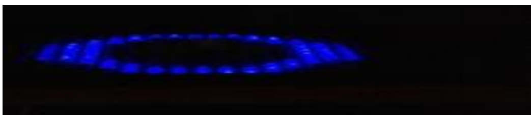
Figure 2: Gleaming of IR LEDs during night using LDR

The camera that is embedded on the robot can click the pictures in day light as well as in night. For night vision the camera is surrounded by cluster of infrared light emitting diodes. The circuit consists of light dependent resistor. The value of light dependent resistor at night is noted down from serial monitor and is set accordingly in program to make IR LEDs on at night. Light of these IR LEDs through camera makes the object visible in dark and able to click pictures in both daylight and dark.