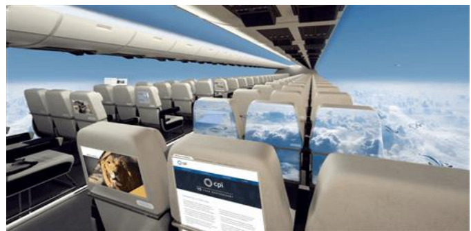
Fig.1: Thin lining of screens on fuselage as well as on back of seats [1]

In order to make passengers feel free from any kind of discrepancy like queasiness, motion sickness or acrophobia at a larger heights, the option of switching the screen displays with any digital wallpaper already present in the memory of screen driving unit can be implemented with the intention of feeling unpretentious atmosphere[6].