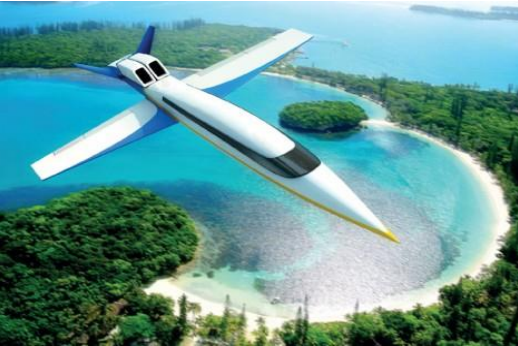
Fig.5: Outer view of Windowless Airplane [6]

Fig. 4 represents the inner cross-sectional view of screen arrangement as well seats management for displaying large panoramic views. Fig. 5 presents the rough model of outlooks of windowless airplane. Outer looks may not be able to give a distinguishable identity between a cargo planes or passenger plane but the features installed inside are making it always preferable choice for the passengers to board this only. Amorphous solar panels can be visualized on the plane's surface and rest all the inner features are being explained in fig.1 & fig.2 under the section 2.